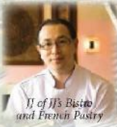
JJ of JJ's Bistro and French Pastry