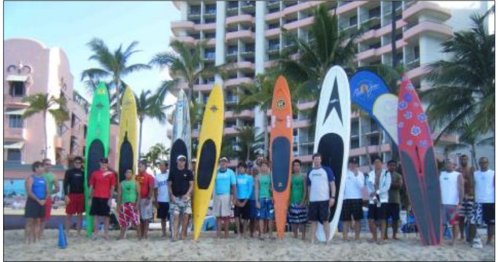
Competitors get set to take to the water for Duke's Waikiki's 3rd annual Waterman Relay Race.